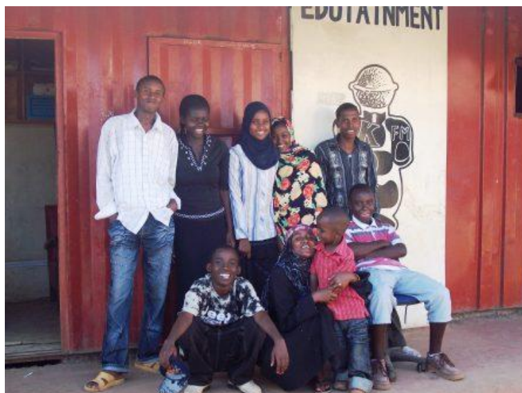
Existing Koch FM container on top of which a container is to be installed as a study center

However the one at Koch FM is proposed to be placed on top of the existing 40 ft container that houses the radio station.