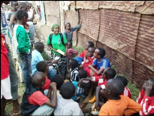
The magazine team doing a story on sports