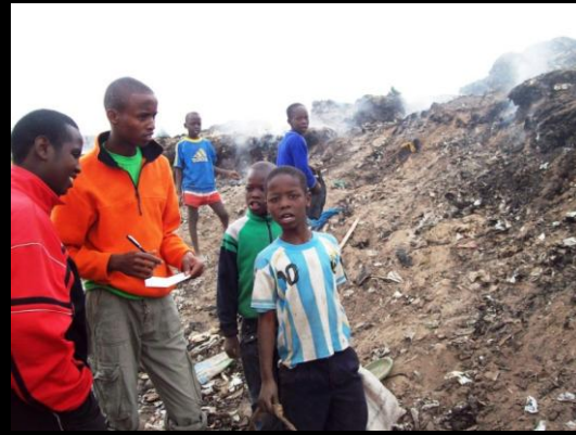
Photography & magazine teams doing a story on children at the dumping site