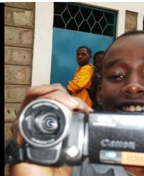
Recording the issues through an eye of a camera