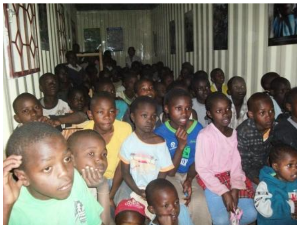
Watching the movie inside the study centre

The academic review took three half days.