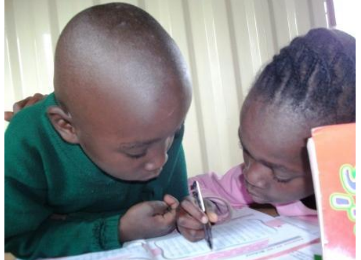
Towards realising their goals....