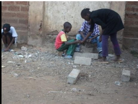
The theatre team rehearsing on a piece about family care to children