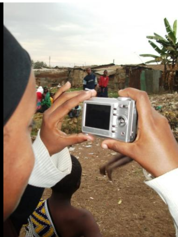
Documenting using still camera