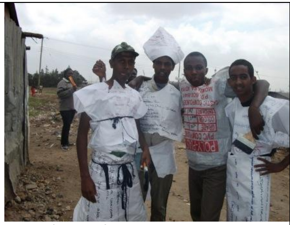
Some of the KCN from other villages ready to paint the centre