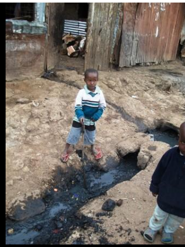
Image by the photography team on environment