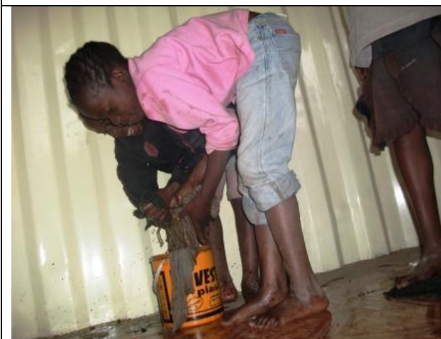
KCN kids from Kisumu Ndogo & Nyayo washing the floor of the study centre