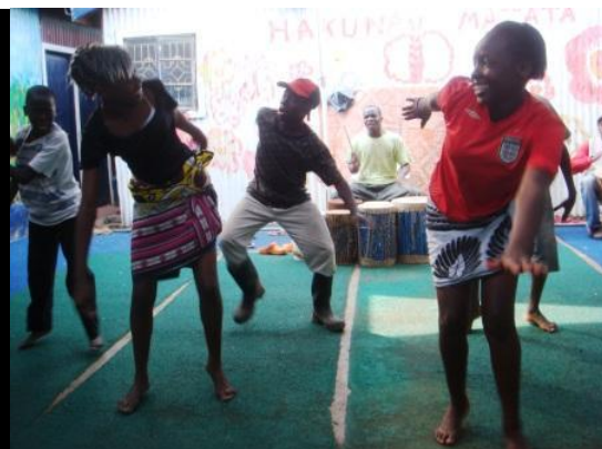
The Dancing club rehearsing