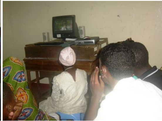
Children watching the video from a computer