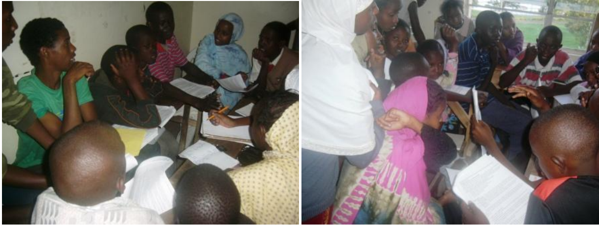
Children in the groups during the academic review

This had lots of insight and profound lessons that the children could very easily identify with. The children also gave their views after the captivating movie, and drawing important lessons as well as necessary soft skills to enable them achieve their academic desires.