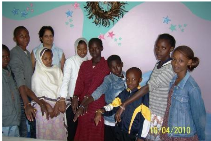
KCN showing off the bracelets they made at Hobby craft